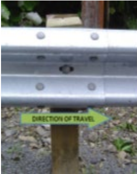
Figure 2: Lapping detail