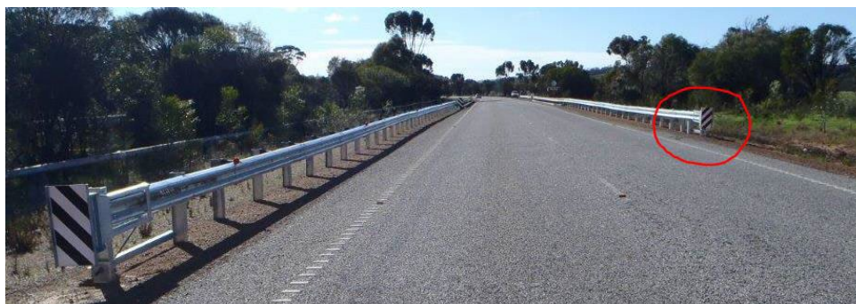
Figure 1: Departure terminal (circled in red)